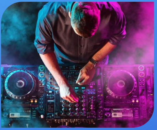
DJ bringing even more life to this big futsal party