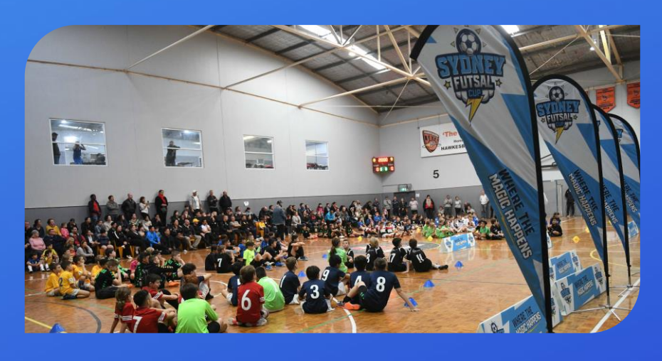
Prizes for MVP, Golden Boot and Golden Glove