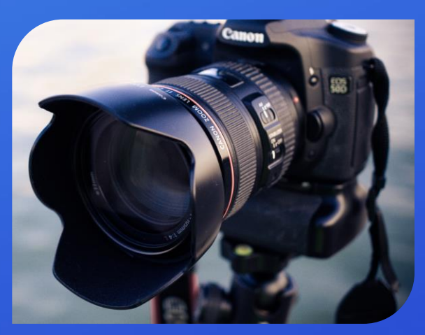
Photographer capturing all the great moments