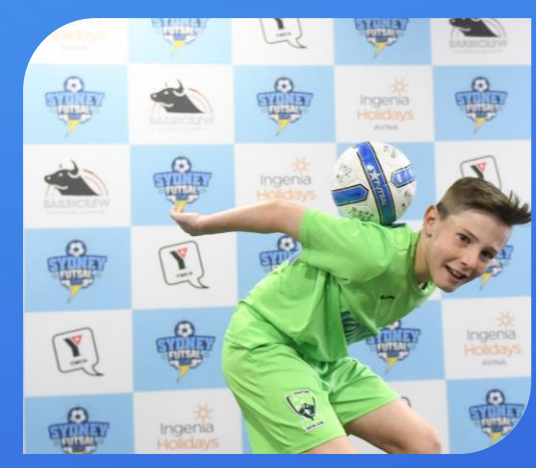
Futsal Contests to keep the ball rolling even during the breaks