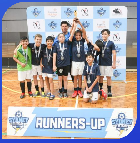
Awards Ceremony with trophies and medals to honor all achievements