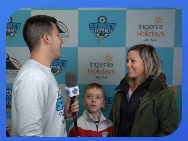
Cameraman and reporter interviewing Players, Coaches and supporters